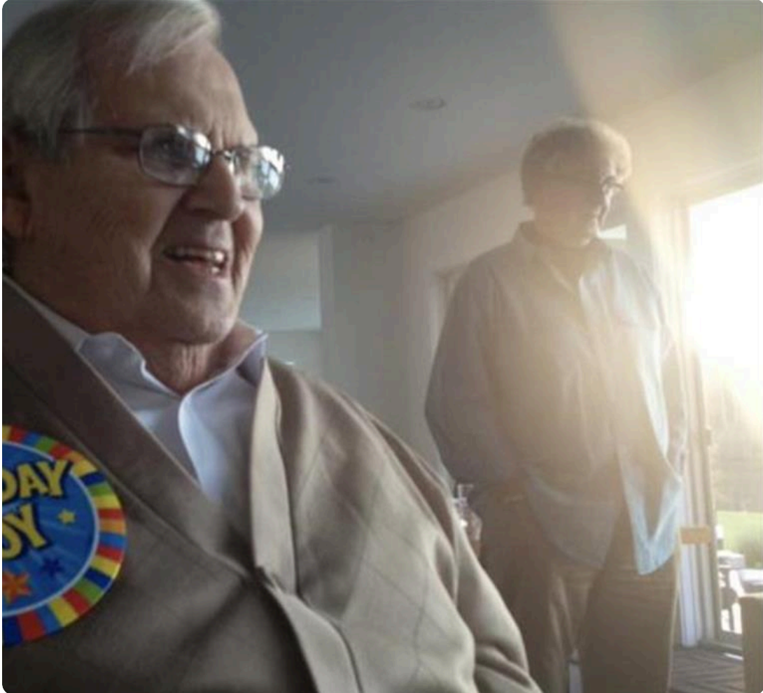
At the top of their game!